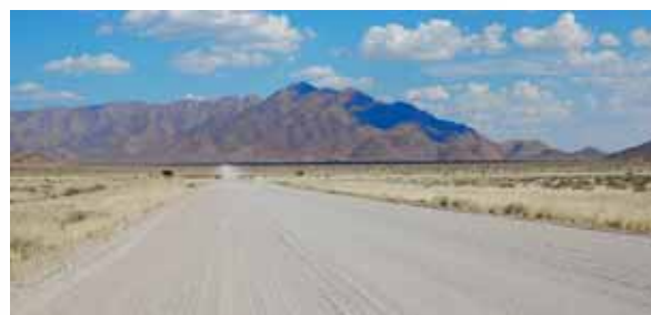
Namibia's gravel roads are generally very well maintained