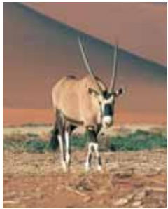
Gemsbok are well adapted to desert life

For some trip ideas, see: self-drives on pages 35–37, fly-ins on pages 38–40, and trips which combine these on page 41. All have prices at the back of this brochure (page 158). For guided trips, see our Wild about Africa programme on page 36. Call us if you're unsure or inquisitive – we're here to help.