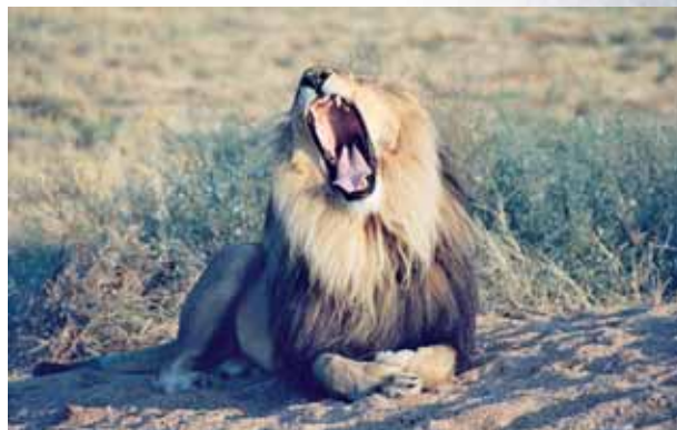
Lions sleep for 18 hours a day

Pages 18–20 It's a 'must' for most travellers, drawn here for some of Africa's most haunting scenery! Stay for longer and experience some excellent walking and hiking in the mountains and desert.