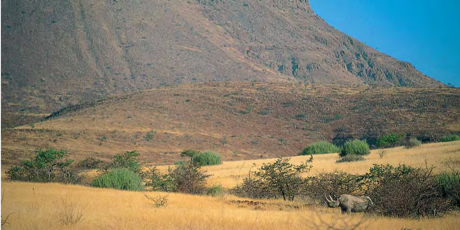
Damaraland is home to thriving populations of solitary wild black rhino

For a real taste of remoteness, try a one-night Palmwag sleep-out. You'll eat around a camp fire with your guide, sleep in a small dome tent and get an even closer feel for the wilderness. (See the Expeditions through Damaraland section, box on the right, for longer trips in a similar style.) Alternatively, Hoanib Camp is a great little camp in an extremely remote location, northwest of Palmwag, with four simple en-suite tents. It offers good food and a fantastic wilderness experience with game drives and walks.