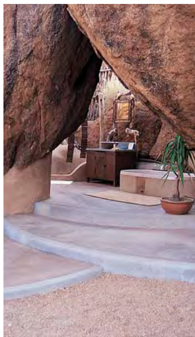
Bathroom in the honeymoon suite at Mowani

Doro !Nawas stands on a rugged, rocky hill close to Twyfelfontein. (The '!' mark indicated a 'click' in the local Damara language.) It's a joint-venture between a safari company and the Doro !Nawas community. The 16 huge chalets have been built from stone, canvas and thatch, and house beds on wheels which can be rolled out under the stars. Doro !Nawas is perfect for a two-night stop; it's not only very good, it's also very good value.