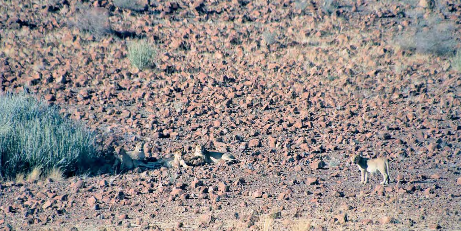
Lion have always been rare in Damaraland – but in recent years sightings of them in the Palmwag area have increased notably