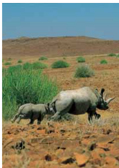
Baby black rhino always walk behind their mother

Doro !Nawas stands on a rugged, rocky hill close to Twyfelfontein. (The '!' mark indicated a 'click' in the local Damara language.) It's a joint-venture between a safari company and the Doro !Nawas community. The 16 huge chalets have been built from stone, canvas and thatch, and house beds on wheels which can be rolled out under the stars. Doro !Nawas is perfect for a two-night stop; it's not only very good, it's also very good value.