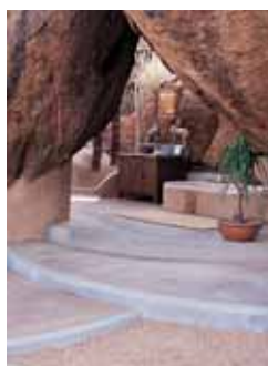
Honeymoon suite at Mowani

For a real taste of remoteness, try a one-night Palmwag sleep-out . You'll eat around