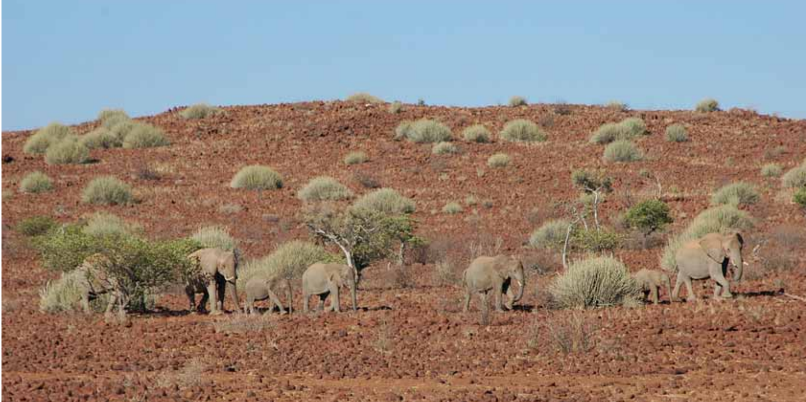
Desert-adapted elephants in Damaraland

a camp fire with your guide, sleep in a small dome tent and get an even closer feel for the wilderness. (See the Expeditions through Damaraland section, box on the right, for longer trips in a similar style.)