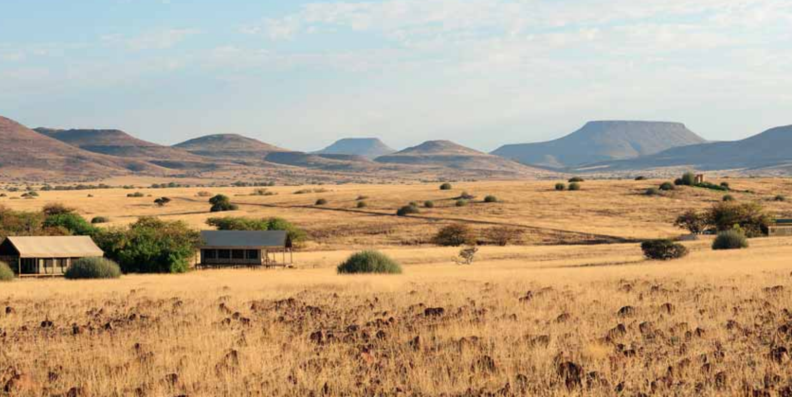
The remote Desert Rhino Camp in the heart of the Palmwag Concession