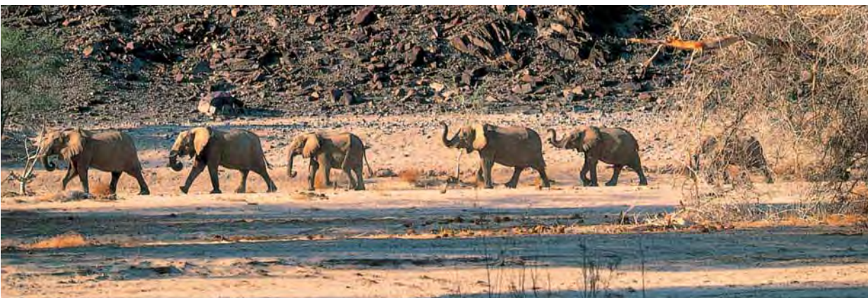
Desert-adapted elephants in the Ugab River Valley

Neither fuel nor park entrance fees are included. In Namibia, petrol is currently about half the price of petrol in the UK, and park fees are currently very reasonable (around £6 per adult per day, plus a fee for the car).