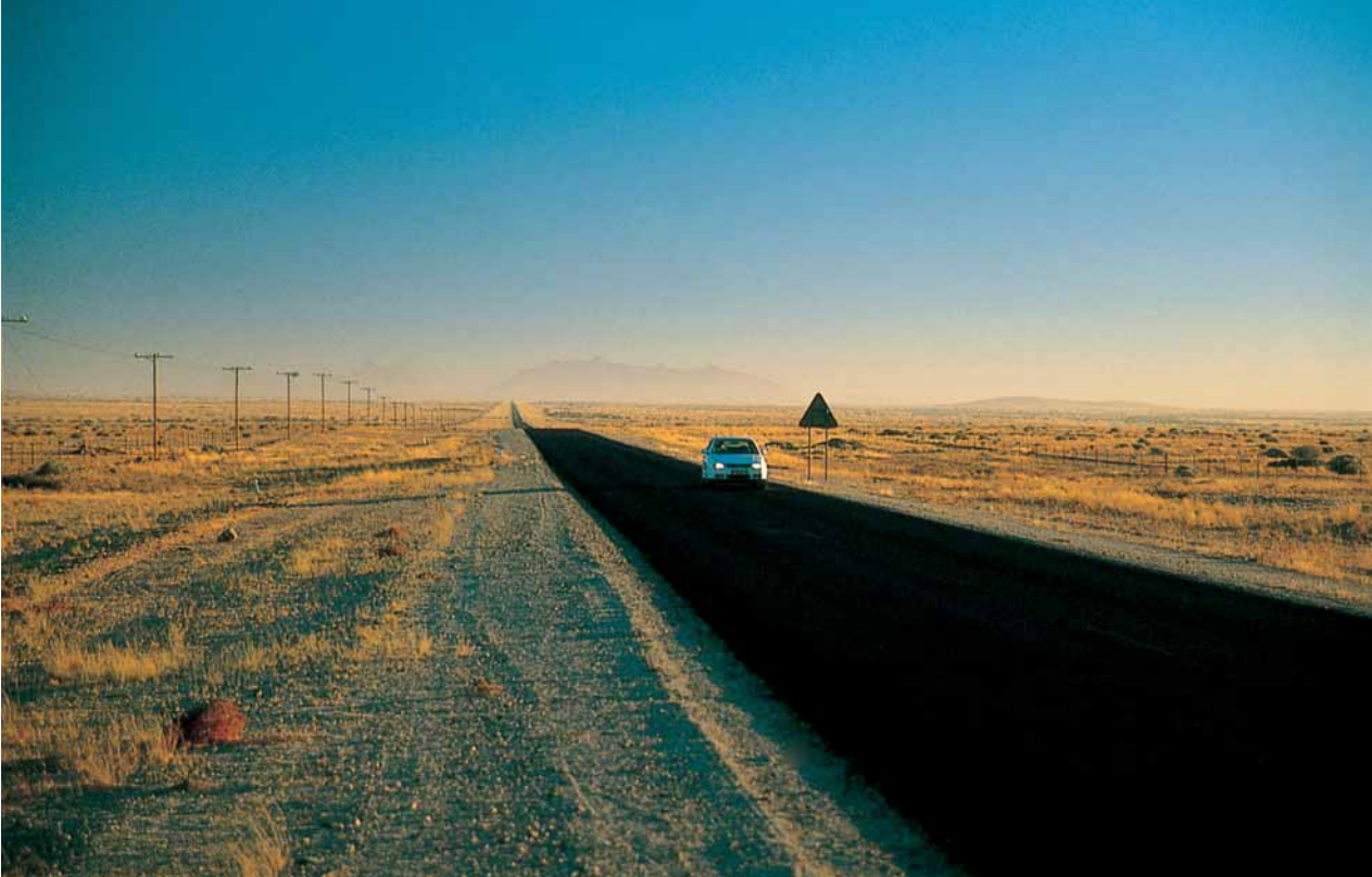
Namibia's main trunk roads are tarred and often very quiet

On the following pages, we have included some 'trip ideas' – with prices at the back of the brochure, on page 158. These are simply suggestions; none are fixed.