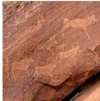
Twyfelfontein is best visited on a self-drive trip