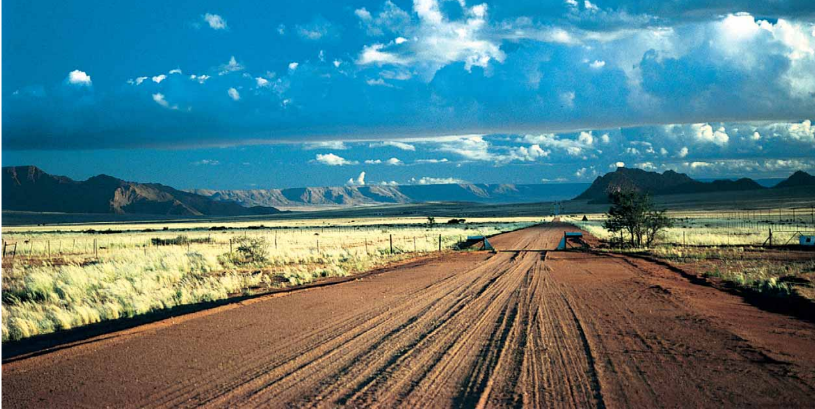
Driving yourself, you're free to stop and take photographs when conditions are perfect