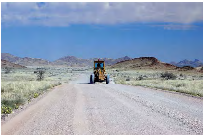
Namibia's gravel roads are regularly graded to maintain them