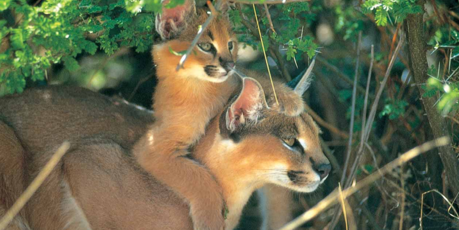
The caracal is a real highlight for those lucky enough to spot this elusive cat