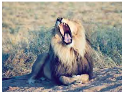
Lions sleep for 18 hours every day

It's good to have currency before you leave