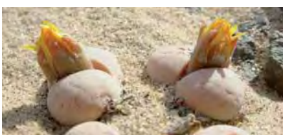
A lithop: one of Namibia's "living rocks"

You'll find plenty of itineraries there, including those mentioned here. All have costs, just like these, as well as detailed information on the lodges, picture slide shows and satellite maps of the areas.