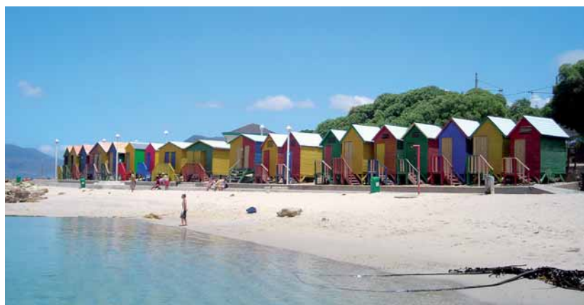
Colourful beach huts on St James' beach, Cape Town

Finally, the Mount Nelson Hotel , or 'Nellie' as locals call it, is a real institution. This is Cape Town's oldest and most famous hotel: a place to be seen, near to the heart of the city. If you like stylish grandeur and old-world charm, then it has the best address in town!