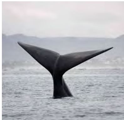
Whale-watching near Hermanus