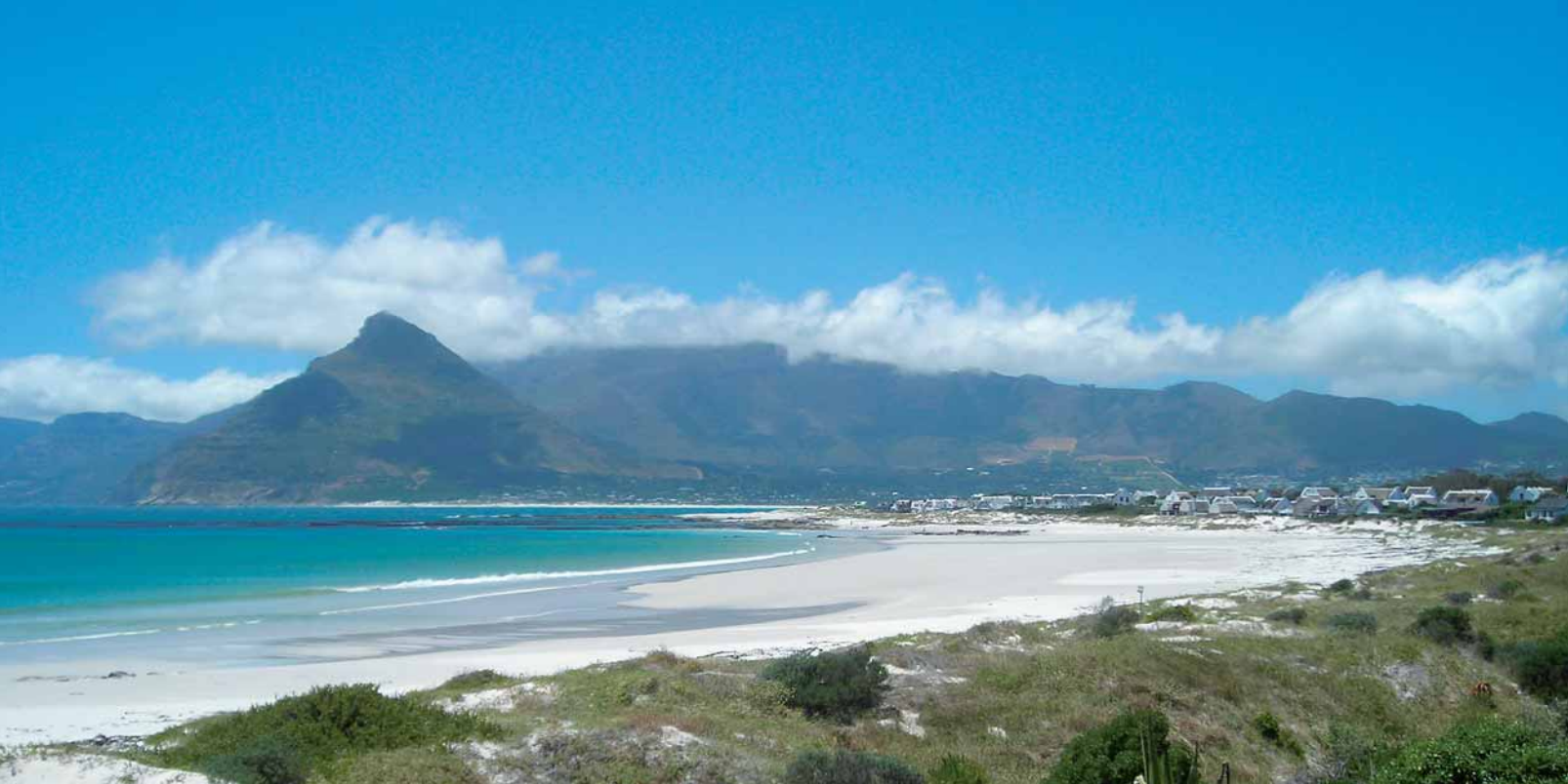
The view from the guesthouse on Long Beach