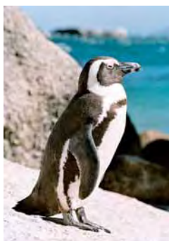
Penguin on Boulders Beach, Cape Town

Out on a limb, at the tip of Africa, Cape Town is one of the world's most beautiful cities. Relaxed and picturesque, much of its splendour comes from its backdrop, the 1,086m Table Mountain. Above, its flat top is often covered by a 'tablecloth' of cloud, which pours over the edge like dry ice from a stage. The ocean is always blue and the sky always crystal clear. Or at least that's how it seems – for Cape Town is naturally enchanting.