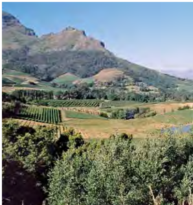
Rolling vineyards near Stellenbosch

There are many places to stay in the Wine Region, so please call us for our ideas. Other favourites include the Lanzerac Hotel and River Manor in Stellenbosch, and the larger, restored Franschhoek Country House , in Franschhoek.