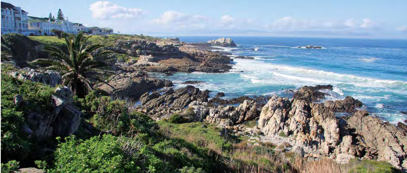
The Marine Hotel in Hermanus overlooks Walker Bay from the cliff tops