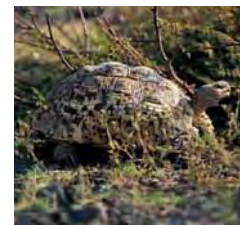
Spots not speed distinguish the leopard tortoise

Mutinondo Wilderness Lodge stands on a large, round granite hill. Its four rustic chalets were a labour of love, built almost entirely from local materials by local craftsmen. They're large and have private showers and toilets, but are not highly polished. Expect rough-hewn stone in this wild and lovely patch of Africa.