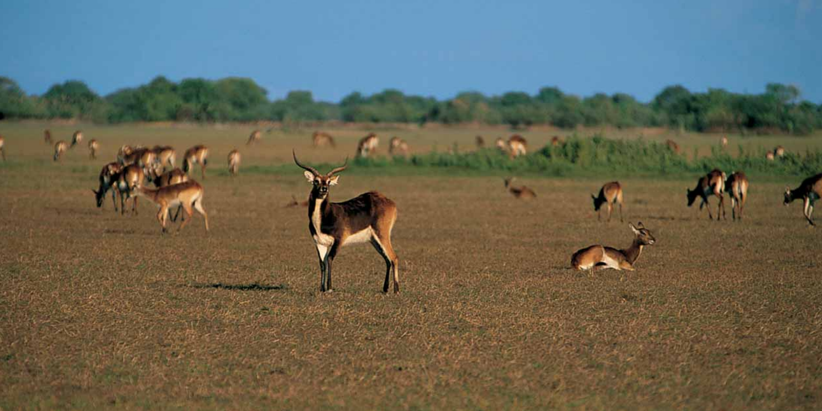
Black Lechwe on the short-grass plains of Bangweulu