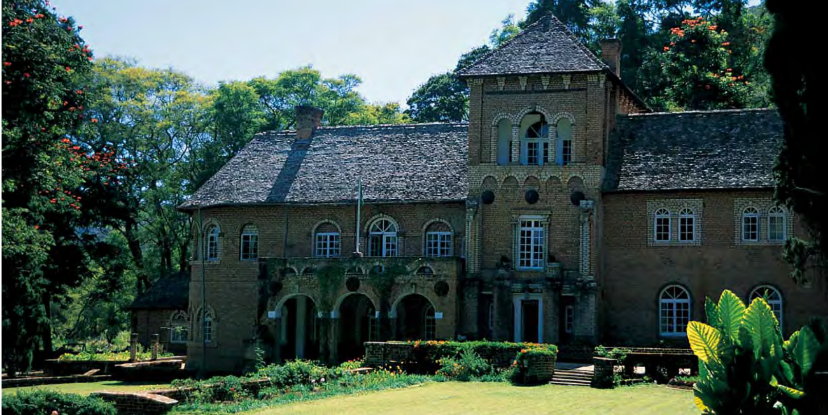
The great manor house at Shiwa Ng'andu