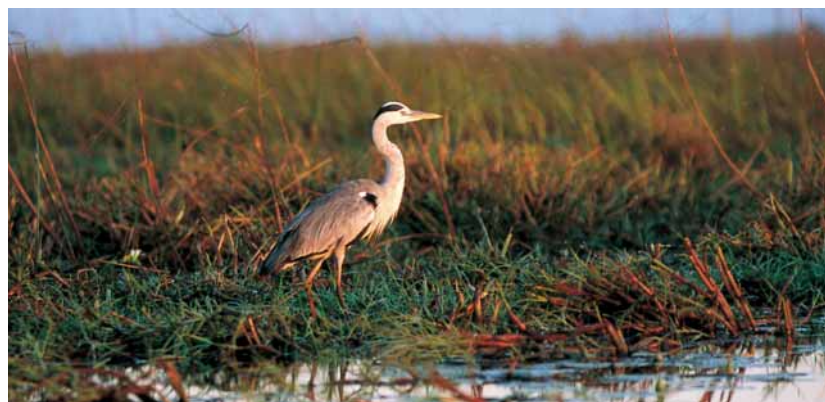
Dawn sighting of a grey heron beside a Bangweulu backwater