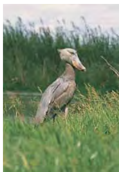
Rare Shoebill storks breed in the Bangweulu Wetlands

From May to December (in the dry season), drives on the surrounding plains are possible, but getting close to shoebills often requires quite demanding walks over (and through!) the floating reed-beds. A visit to Bangweulu is best combined with Kasanka National Park, and possibly Shiwa Ng'andu (see opposite page).