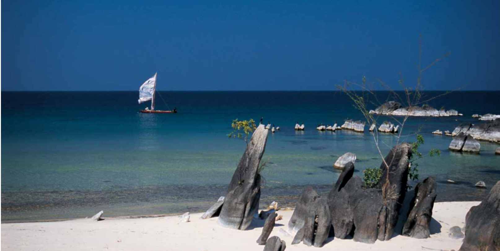
The beach beside Nkwichi Lodge is probably the best beach on the lake