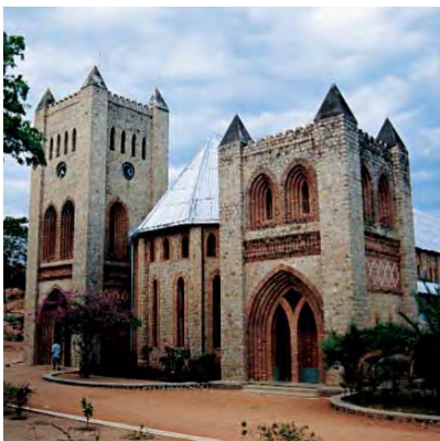
St. Peter's Cathedral on Likoma Island

Kaya Mawa's dining and bar area (complete