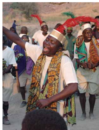
Traditional dancing on Likoma Island