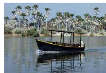
Mvuu Lodge's boat on the Shire River

At its heart is the palm-lined Shire River, whose banks are home to numerous hippos and crocodiles, whilst the adjacent plains and forests harbour elephant, waterbuck, bushbuck, impala and beautiful sable antelope. The rich birdlife includes species from East and Southern Africa – Boehm's bee-eater, the palmtree vulture, Pel's fishing owl and Livingstone's flycatcher. So while Liwonde isn't the biggest or most spectacular safari park in Africa, it has a winning ambience and first-class birdwatching.