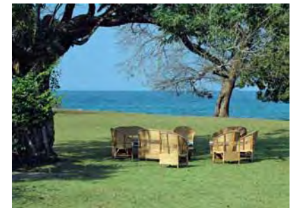
The lawns at Chintheche overlook the lake

Close to the town of Mangochi, Club Makokola , or 'Club Mak' as it's known, is a thatched resort built beside a 600m-long golden beach on the lake's southern shores. It has 56 comfortable rooms, including some suites and family rooms, spread around extensive and beautiful tropical gardens. The furnishings are all