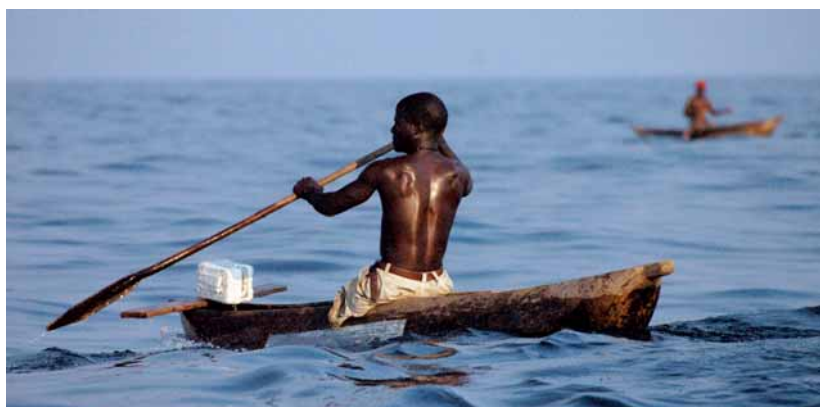
Fishing provides the main source of food and income for many lakeshore communities

Perched on the edge of the plateau, Ku Chawe Inn is a super mountain retreat, with good food and notably friendly service. Commanding panoramic views of the valley below, it makes a perfect base for gentle hiking in search of the birds, wild orchids and the occasional antelope. Lepidopterists will already know that Zomba is renowned for its butterflies.