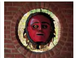
One of the larger carvings at Mua Mission

Costs £1,119 pp sharing for 22 May–30 Jun; £1,244 for 1 Jul–31 Oct; £1,013 for the rest of the year.