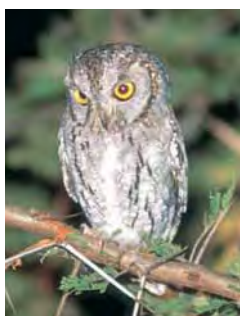
Pearl-spotted owl in acacia