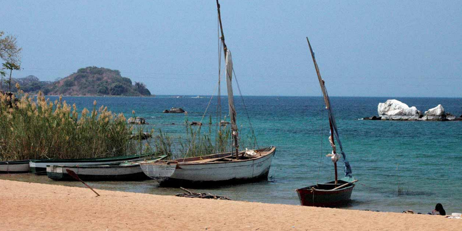
Local fishing boats on the shore of Lake Malawi