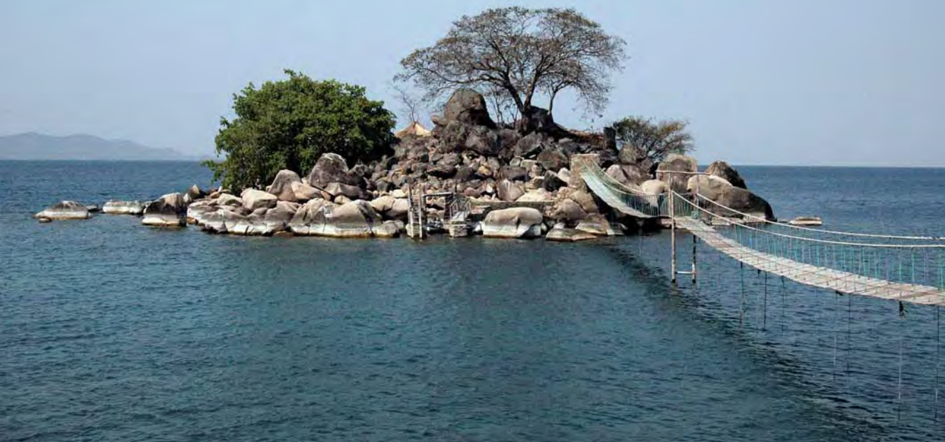
The honeymoon island at Kaya Mawa is reached by a rope bridge