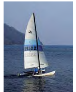
Learning to sail at Danforth

However, the main attraction here is the large, ocean-going catamaran, Mufasa , which is based at the lodge and can be booked for anything from a short sundowner cruise to a journey to the far end of the lake. This stunning 38-foot yacht has 'state of the art' controls and can be used under sail or as a motor-cruiser.