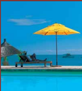
Relaxing by the pool at Club Makokola

The physical and spiritual backbone of the country is Lake Malawi, stretching for over 300 miles and covering more than 20% of the country in water. These clear, mineral-rich waters teem with countless, brightly coloured cichlid fish, many of which are endemic. Away from the lake, two high plateaux, Zomba and Mulanje, tower above rolling farmlands; both offer gentle hiking in a rich wilderness of moorlands and forests.