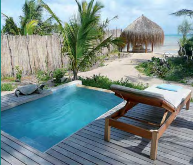
Each beachside villa at Azura has its own private pool, garden, loungers and 'sala'

Long, palm-fringed beaches with sand so fine it squeaks underfoot; remarkable deltas, shady mangrove forests and freshwater lagoons; tropical islands surrounded by turquoise waters, where iridescent fish swim amongst pristine coral: this is the coastline and islands of Mozambique.