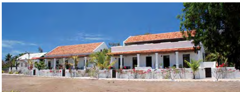
Ibo Island Lodge is a good base to explore this historical island

You can relax or be active here. A daily trip to a nearby sandbank (with good snorkelling) is included, as are trips to explore the mangroves by sea-kayak. With a history of community development, the walking guides at Ibo offer great insights into the island's history and culture.