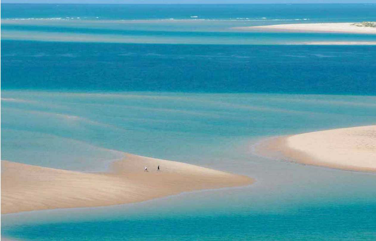
Local fisherman on the sandbanks off Pansy Island, in the Bazaruto Archipelago