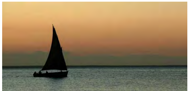
All the lodges on Benguerra Island offer sunset cruises

On the mainland, on its own peninsula, a short boat transfer from Vilanculos town, Dugong Lodge stands on a long beach. This 14-room lodge was completely rebuilt in 2008 and is a possible option for 2009. Talk to us for the latest news on this.