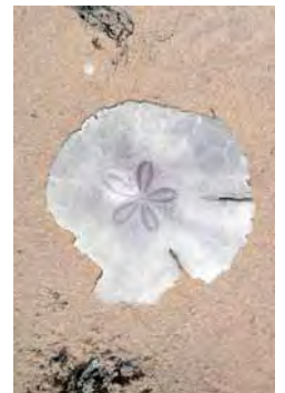
Sand dollars are often found on the beaches

See the map on pages 4–5 to appreciate the sheer size of Mozambique, and to understand why the Bazaruto Archipelago is easiest to approach from Johannesburg. There is at least one flight each day from Johannesburg to Vilanculos; from there, some lodges are reached by air, others by speedboat.