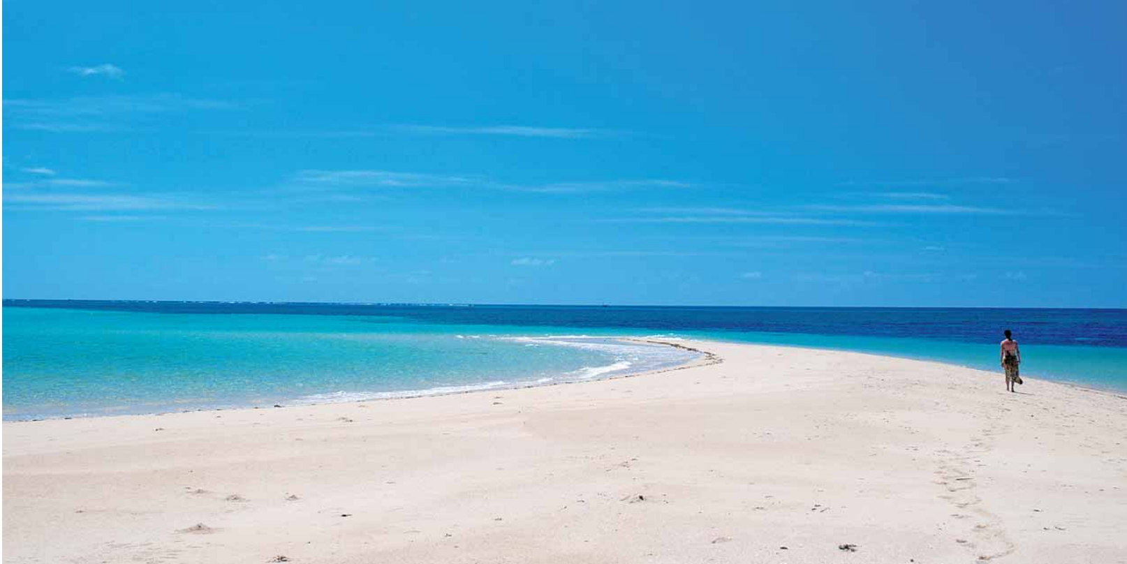
The Quirimbas has numerous sandbanks and small isolated islands lined with beaches

it gets: there's a superb house reef right off the beach and deep coral walls a 10-minute boat ride away. (Other activities include fly-fishing, canoeing, dhow trips, birdwatching, and day trips to Ibo Island.) Quilálea changed hands recently, and changes are planned for 2009 – call us for details.