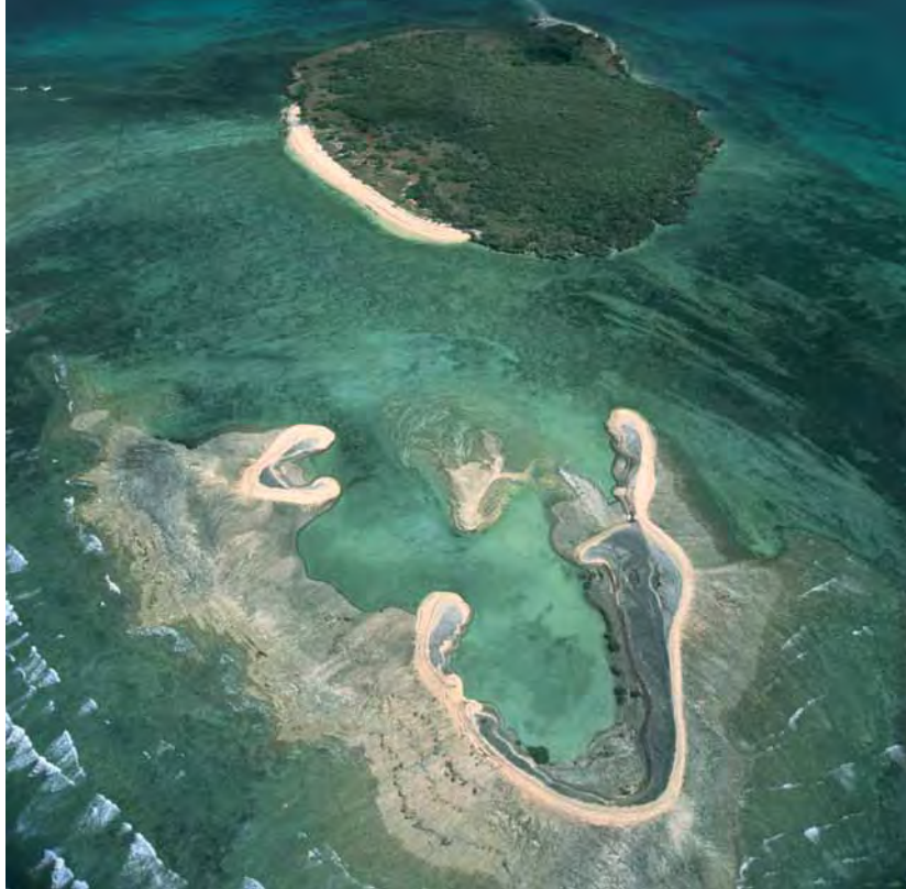
Part of the Quirimbas: pristine islands in a shallow tropical sea