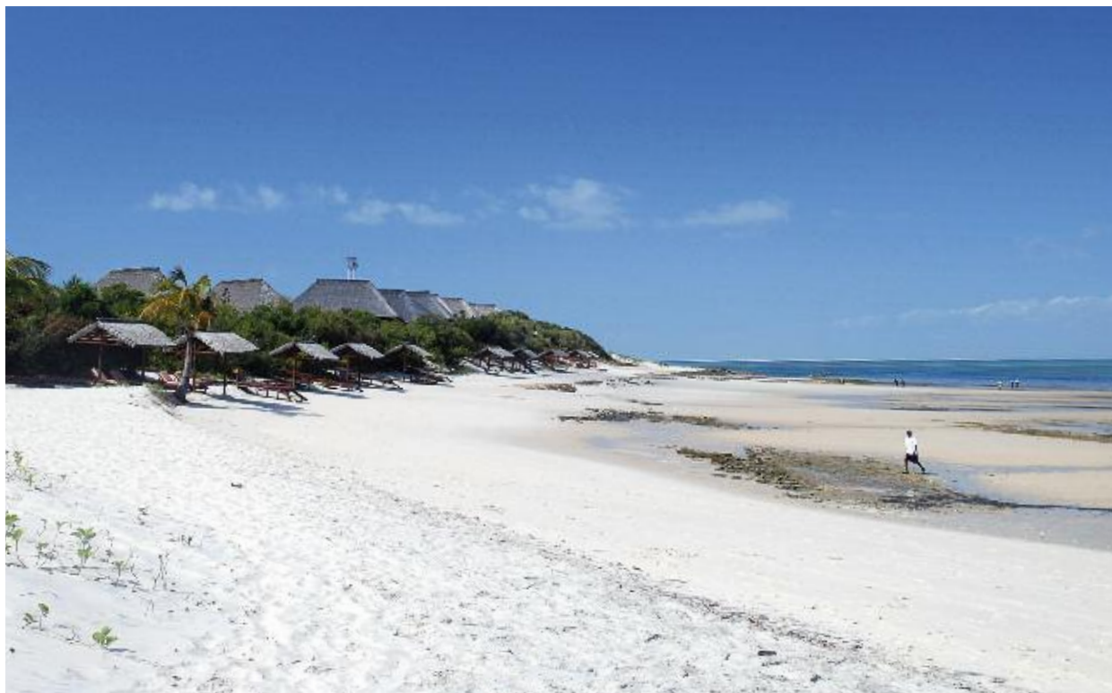
The Bazaruto Archipelago has a number of stunning lodges – set on powdery white sand beaches

Or perhaps consider heading to the beaches of Lake Malawi (pages 142–145), where a handful of high-quality lodges occupy remote locations along the lake's shore. Visit the beaches here as a relaxing, stand-alone trip, or perhaps combine them with a longer safari in neighbouring Zambia.