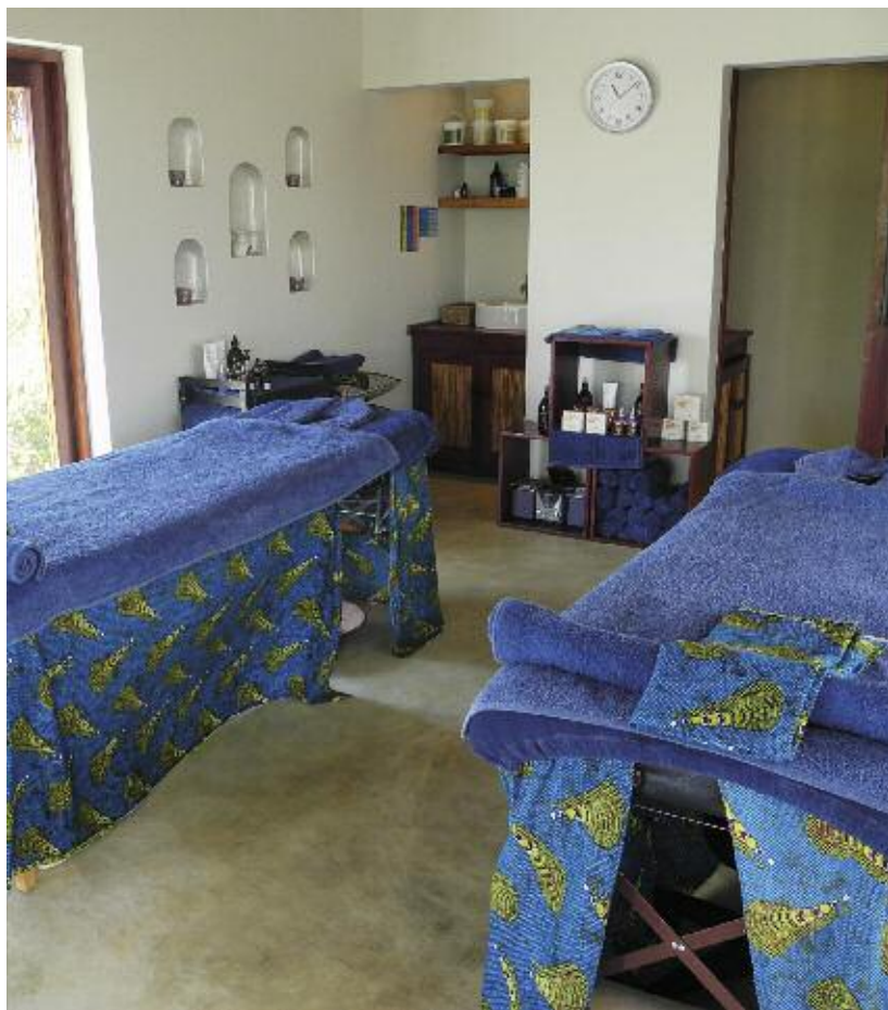
The extensive spa at Azura Mozambique is excellent

In The Cape , many of the hotels offer excellent spa and beauty treatments, including the Vineyard, Constantia Uitsig and the Bay Hotel in Cape Town (all on pages 72–73), and Birkenhead House in Hermanus (on page 74).