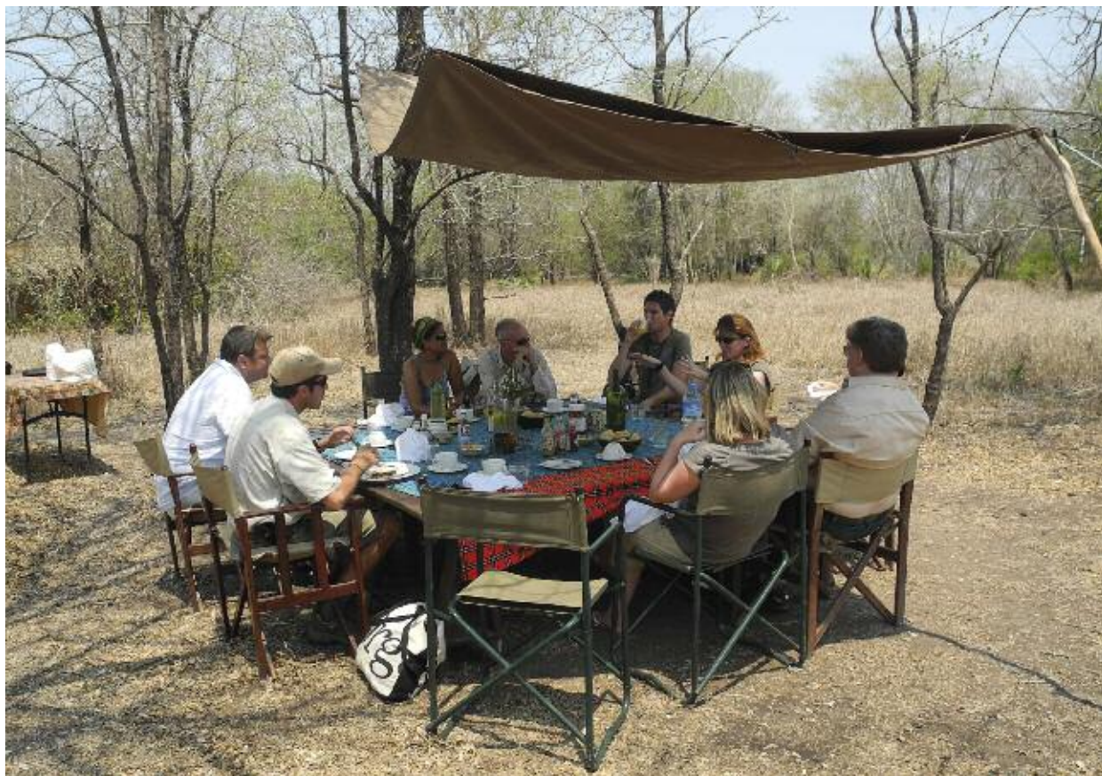
Sociable and relaxing, meals and activities at many camps are in small groups

In Tanzania two excellent options for solo travellers include Lake Manze Camp in Selous (page 176) and Mdonya Old River Camp in Ruaha (page 186). They offer both very low single supplements and group dining, which lends a sociable air. The more luxurious Beho Beho (page 179) is an old favourite for solo travellers – with no single supplement and a continuous 'dinner party' atmosphere it's a great way to get to know other guests.