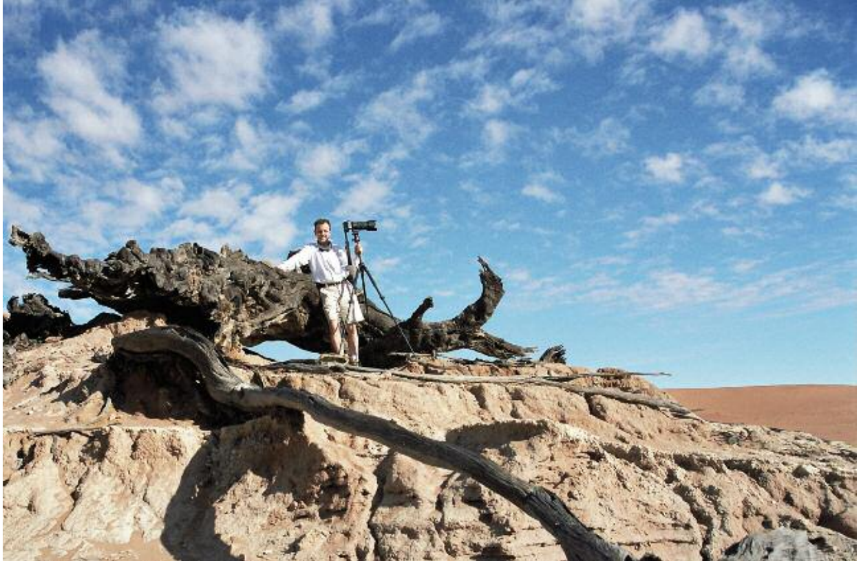
Namibia's varied light and landscapes, and especially its dune-scapes, are addictive for photographers