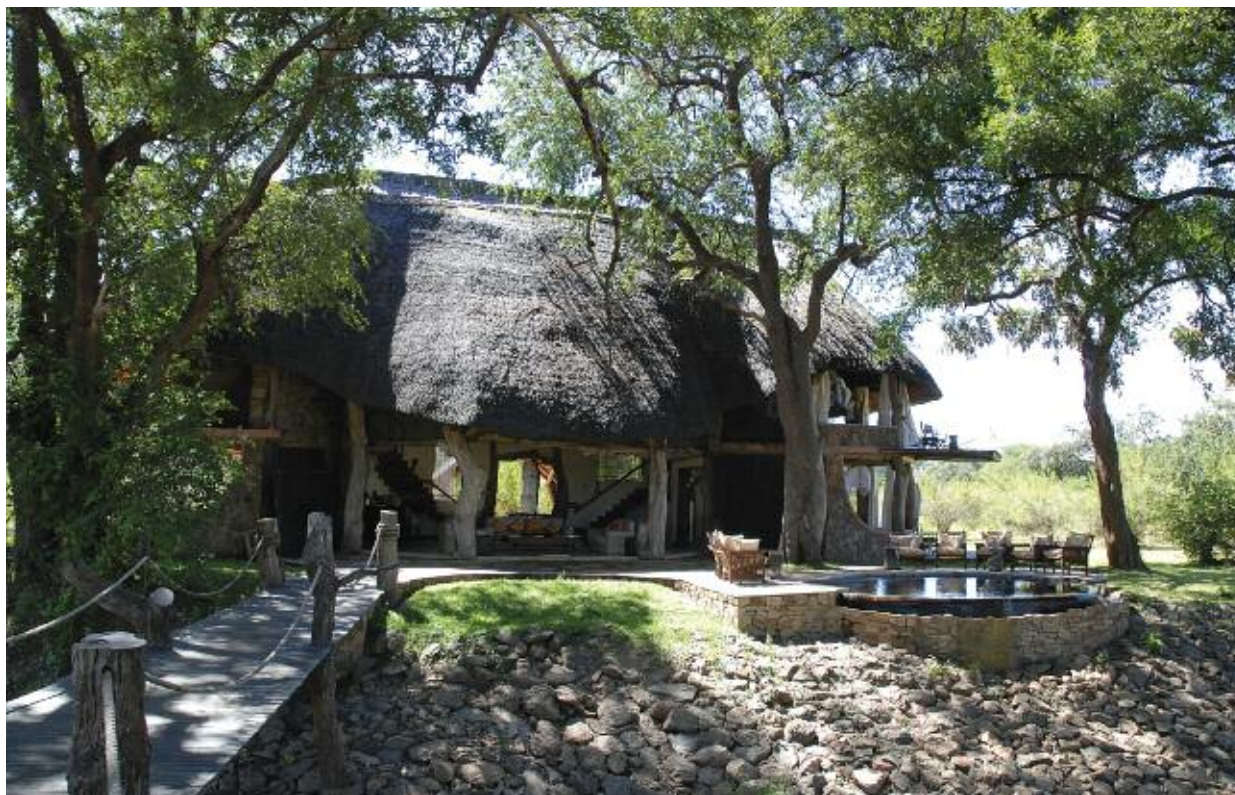
At a private villa, like Zambia's Luangwa Safari House, your group chooses when to go for a game drive, and when to stay beside the pool

As an alternative Indian Ocean retreat, Mozambique's Benguerra Lodge and Azura Lodge (page 237) both have a two-bedroom villa, whilst several seaside self-catering options exist in Seychelles : from the value-conscious Côte d'Or Chalets (page 255) to more luxurious options at Banyan Tree (page 250).