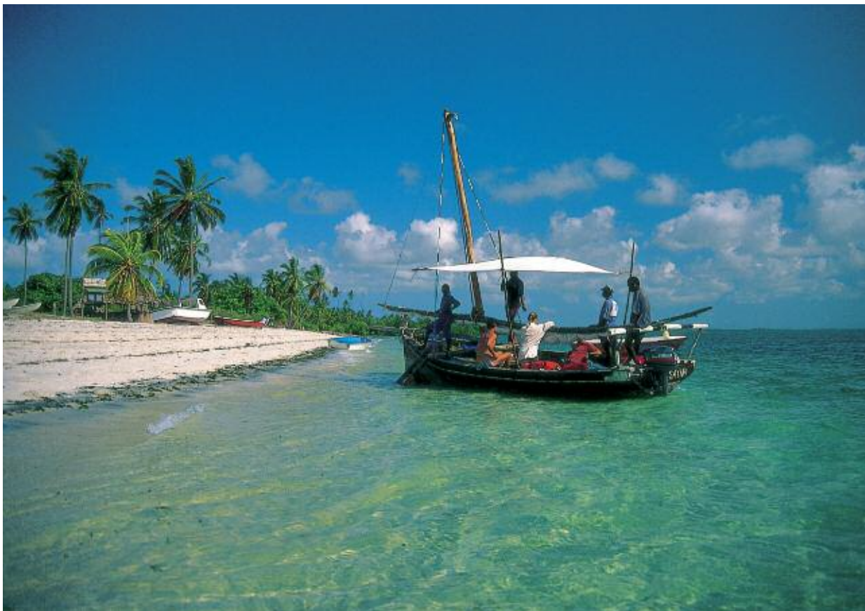
The islands off Tanzania and Mozambique offer superb diving and snorkelling