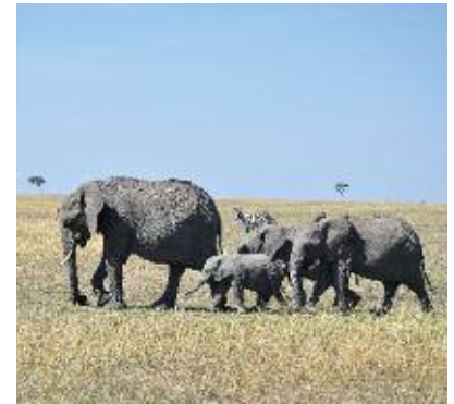
A family of elephants on the vast Serengeti Plains

Meerkat enthusiasts should seek out these entertaining creatures in the Kalahari. The Kgalagadi (page 80) remains the best place to see them, although Jack's, San Camp and Camp Kalahari (page 106) have a