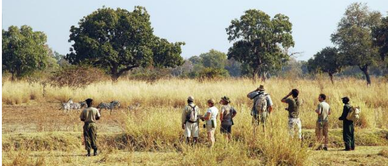
South Luangwa National Park is where walking safaris were pioneered, and it still offers some of the best in Africa