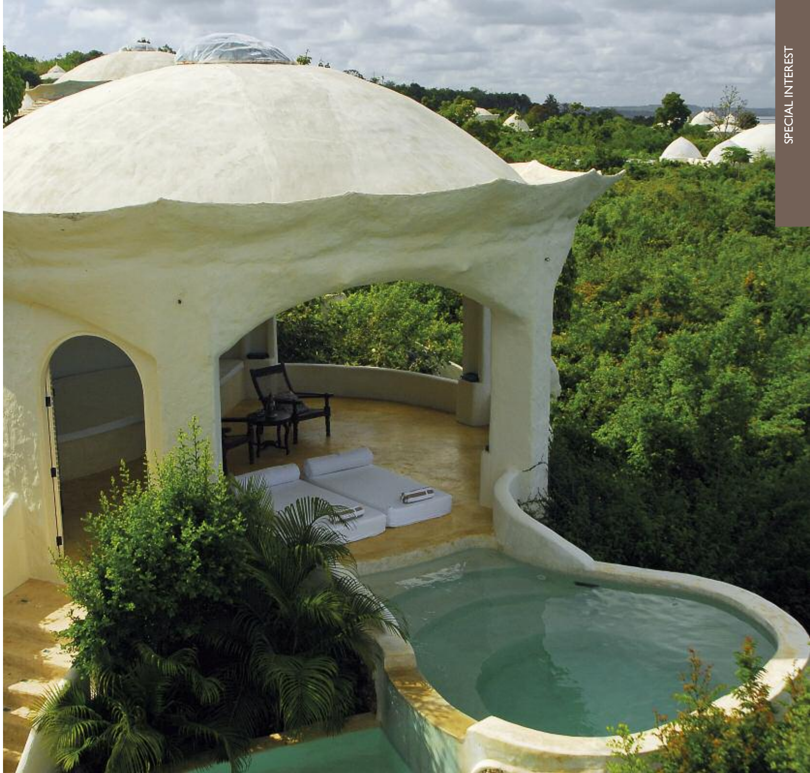
For the perfect honeymoon stay in one of Kilindi's vast pavilions, each with a private infinity pool