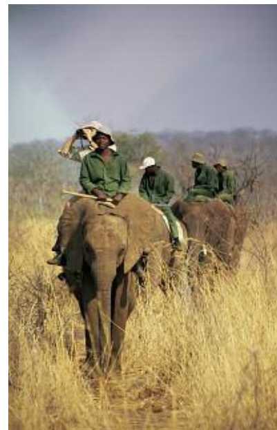
Game-spotting on an elephant-back safari

In Tanzania all three lodges on the Grumeti Reserve (page 210), adjacent to the Serengeti have access to the outstanding stable at Sasakwa Lodge.