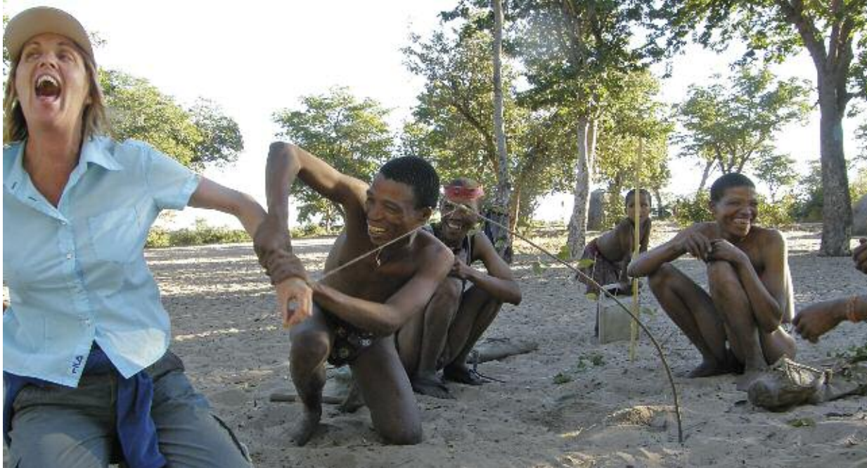
Acting out: Bushmen in the Kalahari show a visitor how a snare works – to everyone's amusement