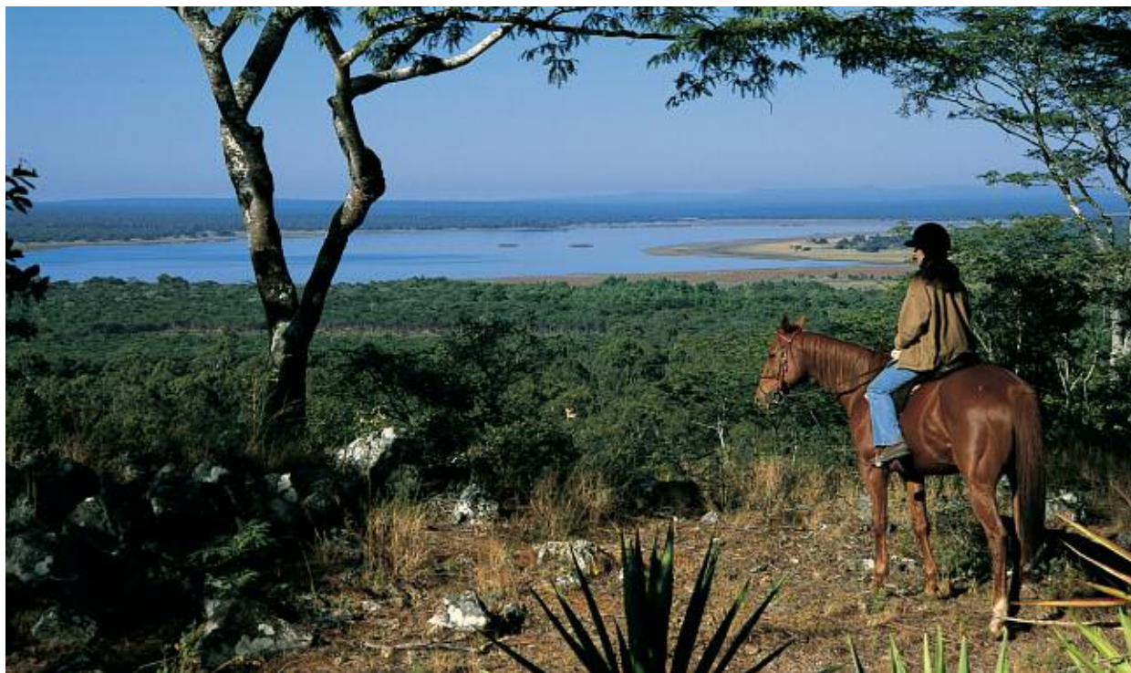
Africa from the saddle - overlooking the Lake of the Royal Crocodiles at Shiwa Ng'andu