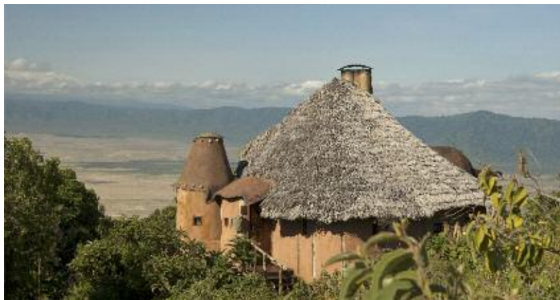
One of the stunning, unusual and romantic rooms at the Crater Lodge

For luxury with high levels of comfort and care, head for a private island in Seychelles (pages 244–269): North and Frégate are world-class, whilst Denis and Desroches will suit less extravagant, more moderate budgets. For a honeymoon exploring the islands, consider the Four Seasons (page 250) on Mahé Island; the Black Parrot Suites (page 253) or Le Duc (page 255) on Praslin; and perhaps Domaine de l'Orangerie (page 258) on La Digue.