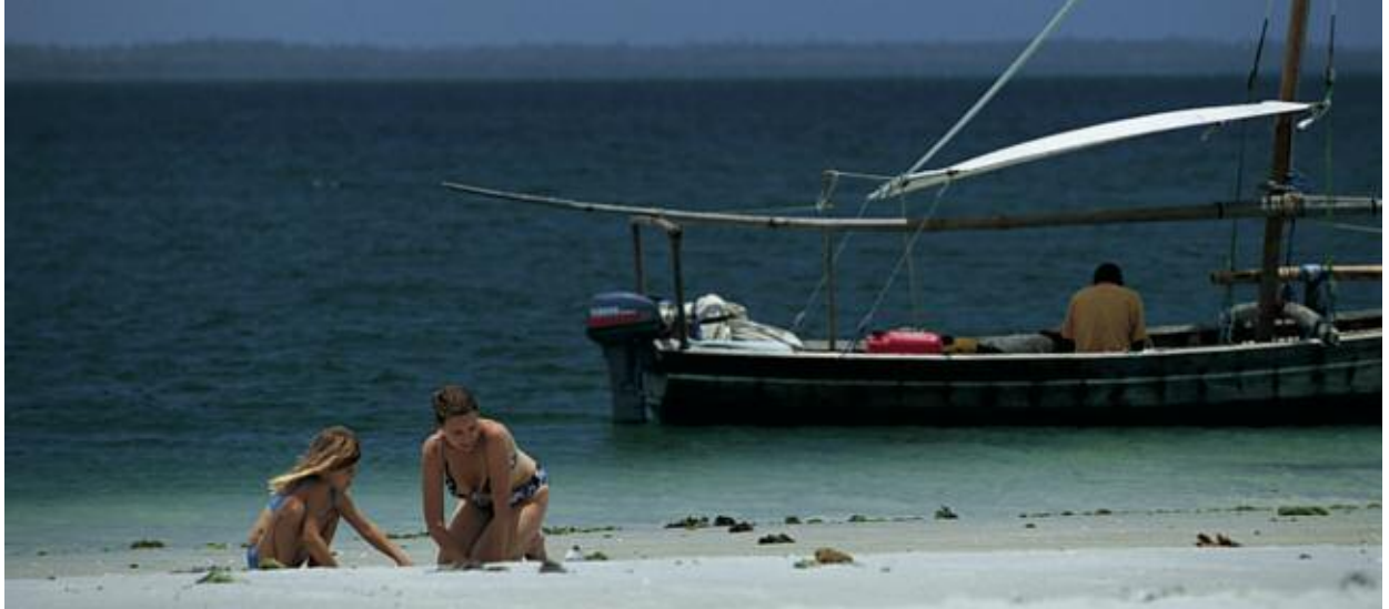
From big game to beaches, Africa is fascinating for every member of the family