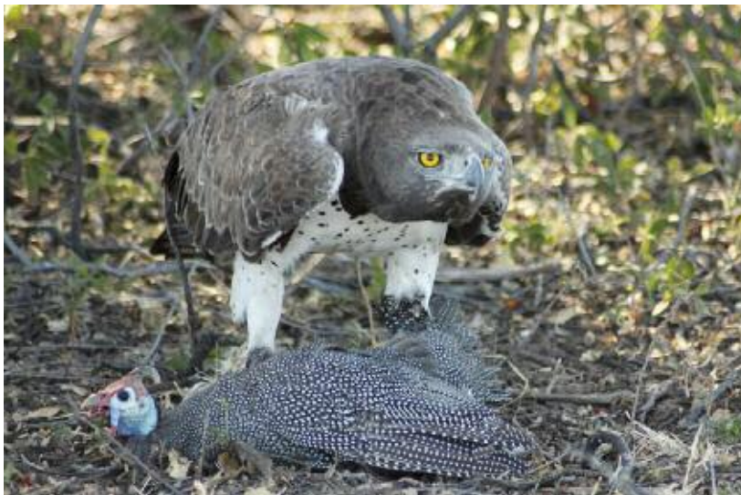
A martial eagle on its prey – a guineafowl

Unlike Zambia and Tanzania, Namibia isn't generally disrupted by its rains, which is fortunate, as this is the best time for birdwatching. The amazing reserve of Sandwich Harbour (visit on a day trip, page 39) shouldn't be missed whilst, further north, in Etosha (pages 44–47), flamingos breed when the pans fill and great flocks of graceful blue cranes descend upon the park. Namibia's best area for birds is certainly the Caprivi Strip (pages 58–59), where you'll find many species usually associated with Botswana's Okavango Delta.