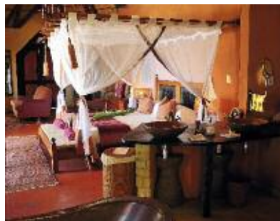
One of the spacious villas at Benguerra

A short plane hop away, Zanzibar's highly original Kikadini Villas (page 219) combine