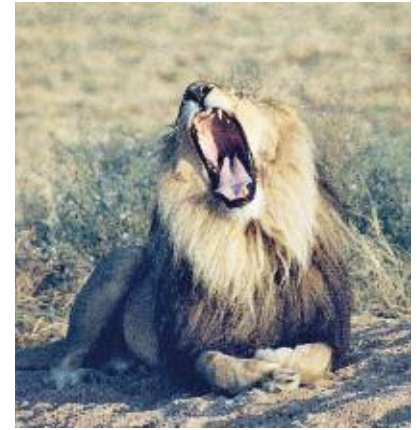
Lions sleep for 18 hours a day

For the best of both worlds, consider dividing your trip between flying and driving – so you can take in the stunning scenery from the air as well as from the ground!