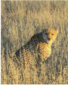
Cheetah in the Kalahari - a rare sight