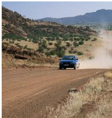
A normal saloon car is fine for most roads in Namibia

Pages 38–39 A convenient stop between the dunes of the Namib-Naukluft and further north, Swakopmund is also the springboard for various adrenalin sports, and some great short excursions. Stay here for at least two nights if you're driving.