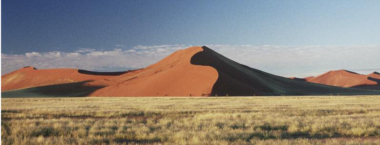
As you approach the dunes their sheer size is breathtaking

Barely five minutes' drive from Sesriem, Sossus Dune Lodge has 25 elegant, thatched chalets linked by wooden walkways. As the flagship of the state-owned Namibia Wildlife Resorts , this is the only lodge inside the national park's gates, making it the best base for very early, or very late, access to the dunes.