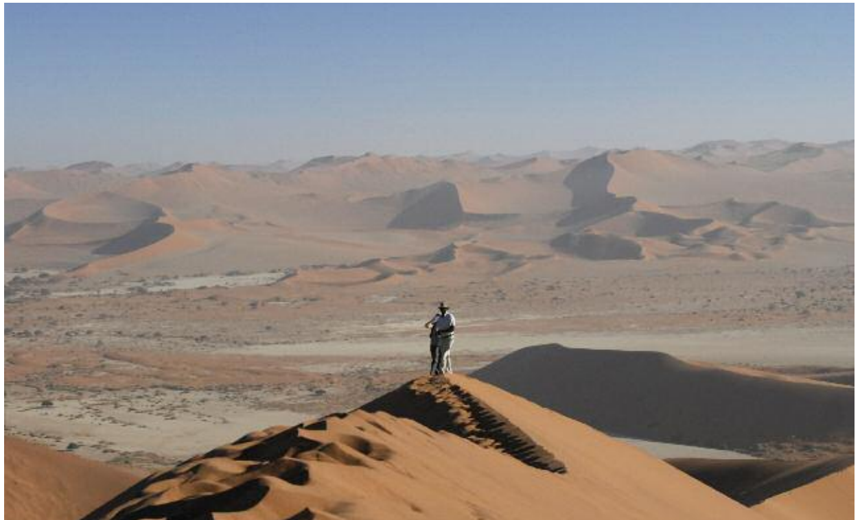
Climbing the dunes at Sossusvlei - arguably the highest in the world

To do justice to this region and explore the mountains and the dunes properly, stay for three nights. With more time, it's best to split your stay between Sesriem and either the Naukluft Mountains or the NamibRand Reserve.