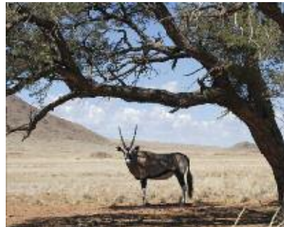
Oryx sheltering from the midday sun

About 45km from the lodge, Wolwedans' newest addition is the small and remote