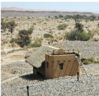
Sleep under the stars at Kulala Desert Lodge

There are other places to stay in this region such as the tented Sossusvlei Lodge at Sesriem and its nearby sister property, the simple yet comfortable Desert Camp . The cool, functional Namib Naukluft Lodge , basic Weltevrede Restcamp , imposing Le Mirage Desert Lodge & Spa and substantial Namib Desert Lodge are other options. We have visited all of these personally; see our website and ask our team of experts for more details about them.