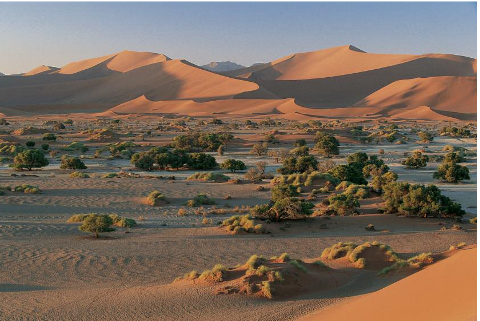
Sossusvlei dunes at dawn

Further north, Hoodia Desert Lodge is in a beautiful location at the foot of the mountains next to the Tsauchab River. Soak up the stunning views from the comfort of 12 attractive thatch-and-canvas chalets, or from the small pool. Great food is served by firelight in the dining room, or in warmer weather on the lantern-lit veranda.