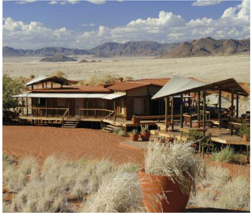
Wolwedans Dunes Lodge has a lovely setting with views of the NamibRand's surrounding landscape

Boulders Camp. As its name suggests, it's set amongst the granite boulders of a kopje. With just four spacious tents, each with a king-size bed, it has a really exclusive feel.