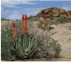
Flowering Aloe in the Namib-Naukluft