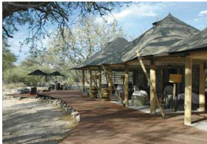
Private camp comforts: the open-sided lounge at Onguma Tented Camp

The roads in Etosha are shared equally by vehicles and game