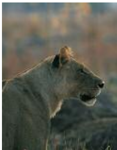
A watchful lioness enjoying the morning sun