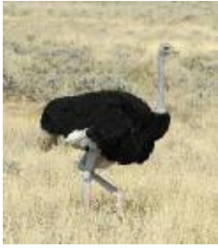
On the run!