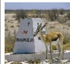
Even the locals take heed of Etosha's clear signposts