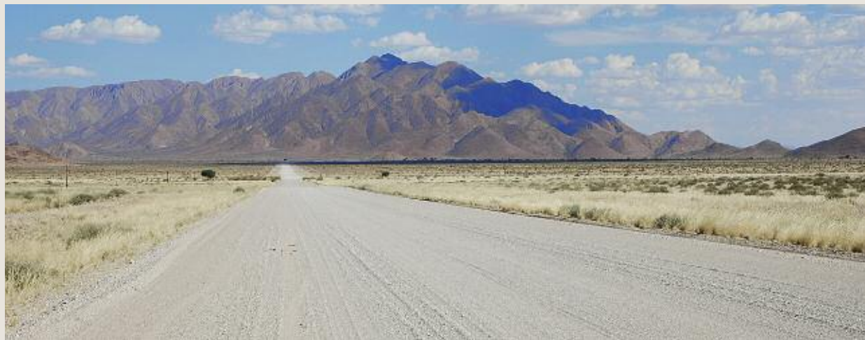
Namibia's gravel roads are generally very well maintained