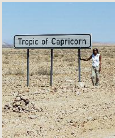
Crossing the tropic

Driving: Distances are great, but the country has some of the finest roads in Africa. Traffic is light; driving is on the left and is normally a pleasure. The main roads are tarmac; gravel roads, even in more remote areas, are usually well maintained. We include route maps, directions and detailed information with your travel documents.