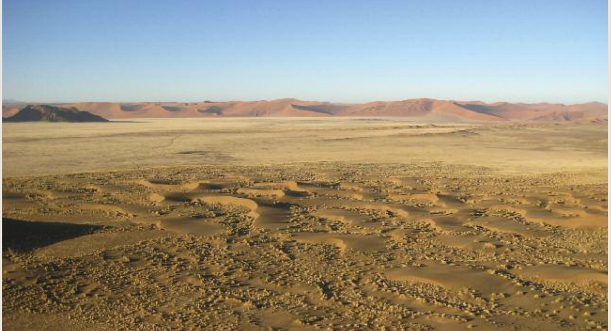
Dune diversity near Sossusvlei - smaller, yellow crescent dunes backed by larger red star dunes, pictured here from the air