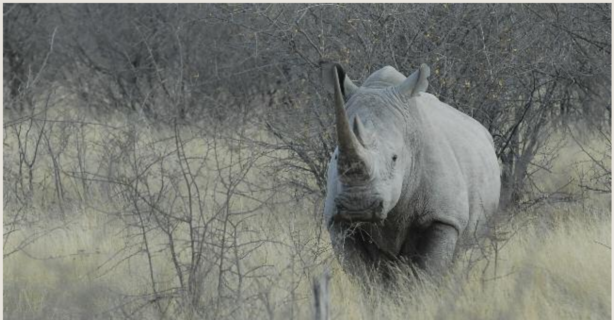
White rhino are often seen on the Ongava Reserve