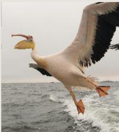
Close encounters on a lagoon cruise

Driving in Namibia is normally a joy; the roads are quiet, it's generally safe and easy, and it's a great way to see the country and meet the people.