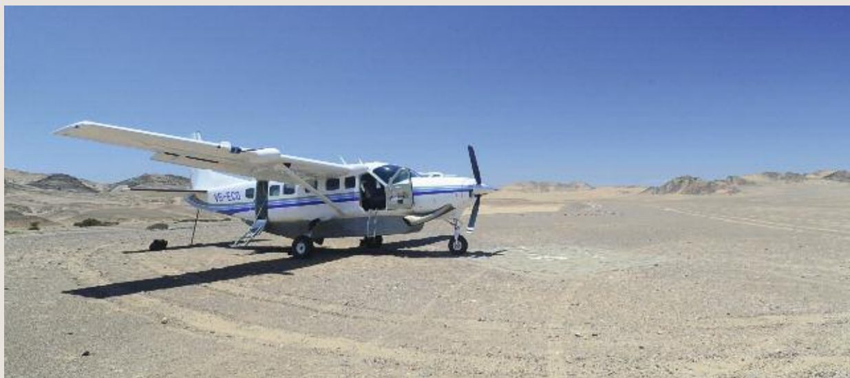
12-seater Cessna Caravan

≠ The Bateleur and Goshawk Fly-in Safaris usually visit Damaraland Camp and Ongava Tented Camp, but these may be swapped for Desert Rhino Camp and Ongava Lodge.