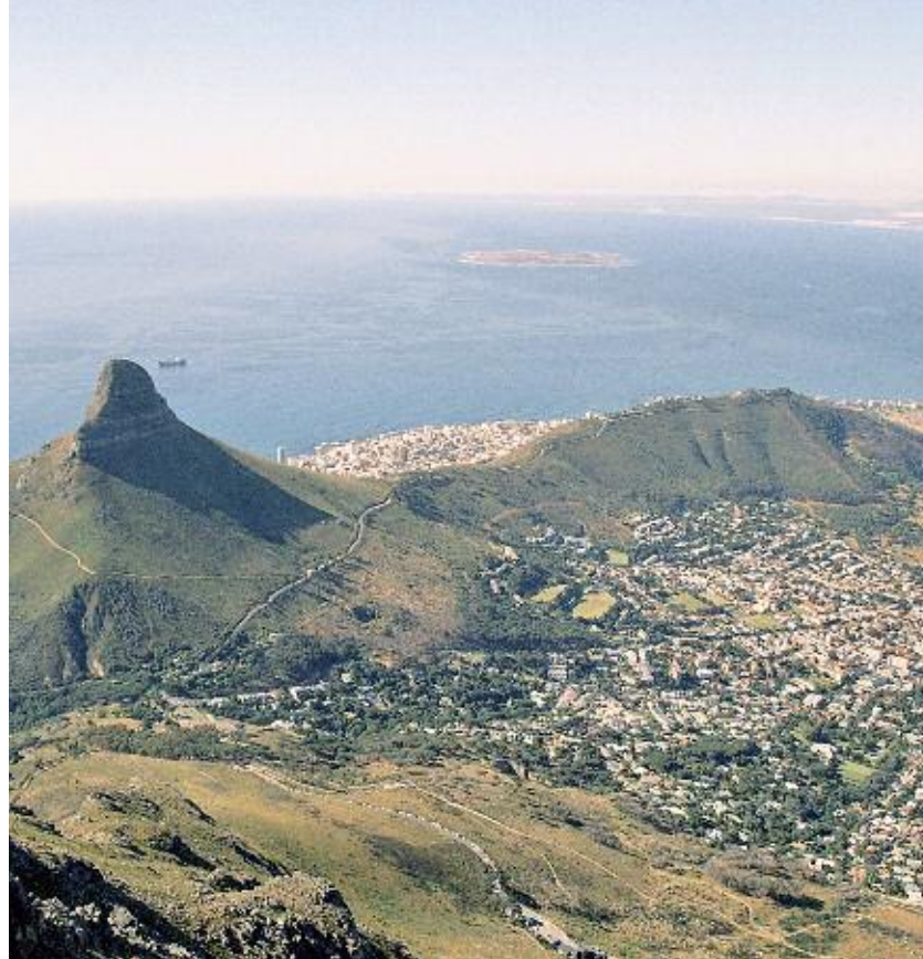
View of Cape Town from the top of Table Mountain including Lion's Head, and in the background Robben Island