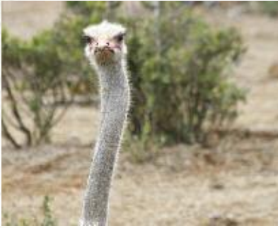
Ostrich watching tourists in Addo Elephant Park