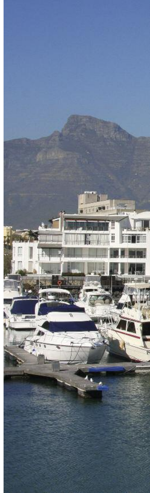
View across the V&A Waterfront towards Table Mountain

Driving: Roads in the Cape are mostly good and well signposted; you drive on the left.