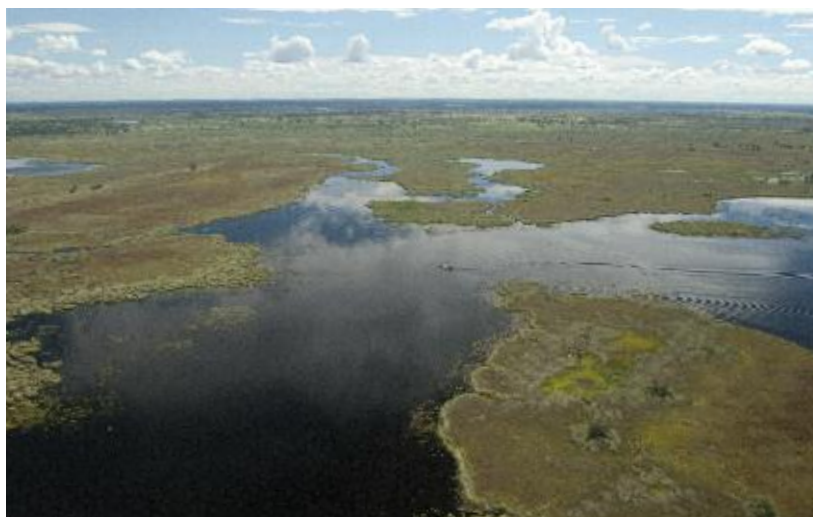
Travelling between camps by light aircraft offers superb views of the Delta

Another simple tented camp in the area, now just a couple of years old, is Banoka Bush Camp . Larger than Khwai Tented Camp, Banoka has eight sizeable walk-in