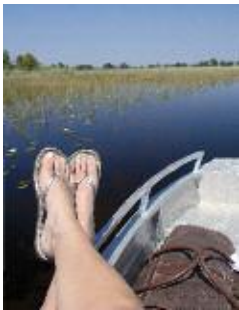
Putting your feet up in the Delta