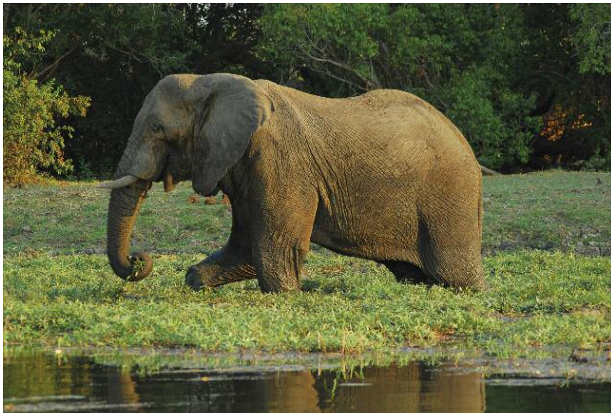
An elephant crossing the Kafue River

Activities include day and night game drives in open 4WD vehicles, guided walks, excursions to Lake Itzhi-Tezhi, and visits to the nearby Shezongo cultural village.