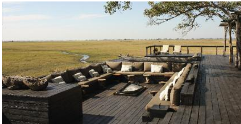
The lounge at Shumba Camp looks out across the Busanga Plains

A 90-minute drive south of the Busanga Plains mentioned to the right, Musanza Bushcamp is a simple camp; its six khaki, walk-in, zip-up tents are shaded by tall trees growing on the banks of the Lufupa. Each has comfortable twin beds, cotton duvets, a hanging wardrobe and a luggage rack – plus a flush toilet and a bucket shower (water is heated on request). Musanza has all the essential camp comforts, whilst keeping a sense of adventure in the wilderness – meals are often taken outside under the stars.