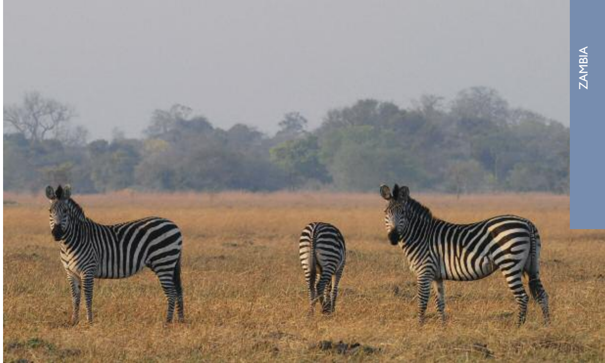
Zebra in evening light

Suggested trips to the Kafue include the great value Zambia Wildlife Safari , which has a set itinerary and the Boehm's Zebra Safari (both on page 138).