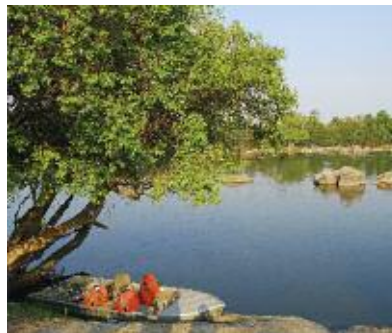
Kaingu offer boat safaris as well as drives

Further south, Nanzhila Plains Safari Camp overlooks the grass-fringed Nangandwe Pool, which attracts herds of game such as roan and sable antelope, Defassa waterbuck and eland, and attendant predators, including wild dog and cheetah. It accommodates 12 guests in three solidly built thatched cottages and three simpler safari tents, each of which