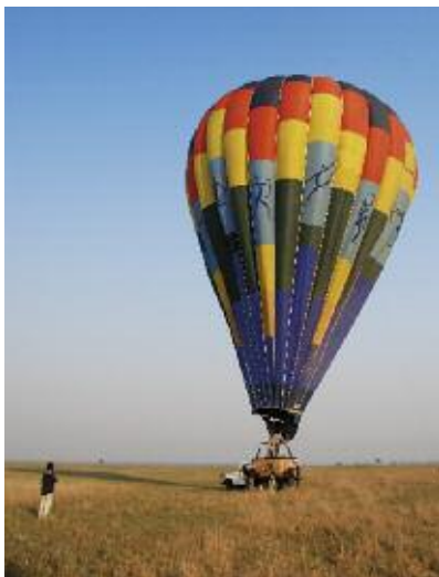
A hot air balloon ride is a great way to see the Busanga Plains

for the whole of 2012 whilst it undergoes a radical transformation. We expect it to re-open in 2013 as a very different style of property – with platforms raised high off the ground and just the stars forming your roof. It should be very much like its sister property in South Luangwa, Kalamu Starbed Camp (page 128). Ask us for the latest details.