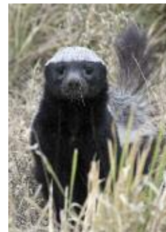
Honey badgers can be pugnacious

Somalisa's plunge pool has become a major attraction for local elephants