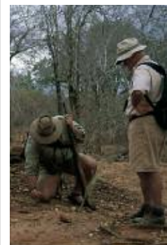
Lion-tracking on a walking safari