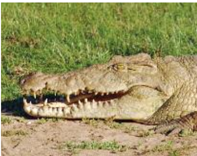
Crocodiles keep their mouth open to cool off

centres on the therapeutic value of the bush, and treatments offered include aromatherapy, stone massages, crystal massages and sound therapy.