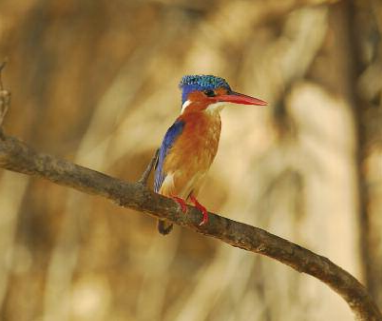
Malachite kingfisher resting on a branch