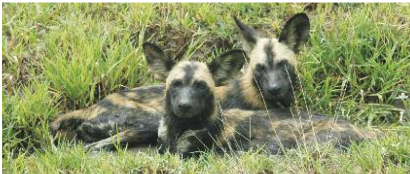
The Selous offers one of the best chances of seeing wild dogs in Africa

Sleeping out in the bush in Africa might seem a little scary, but there's always an armed game scout nearby to reassure you. We love fly-camping and can't recommend it too highly for adventurous adults (but note that these trips aren't for children). Talk to us about it – to see if it's for you.