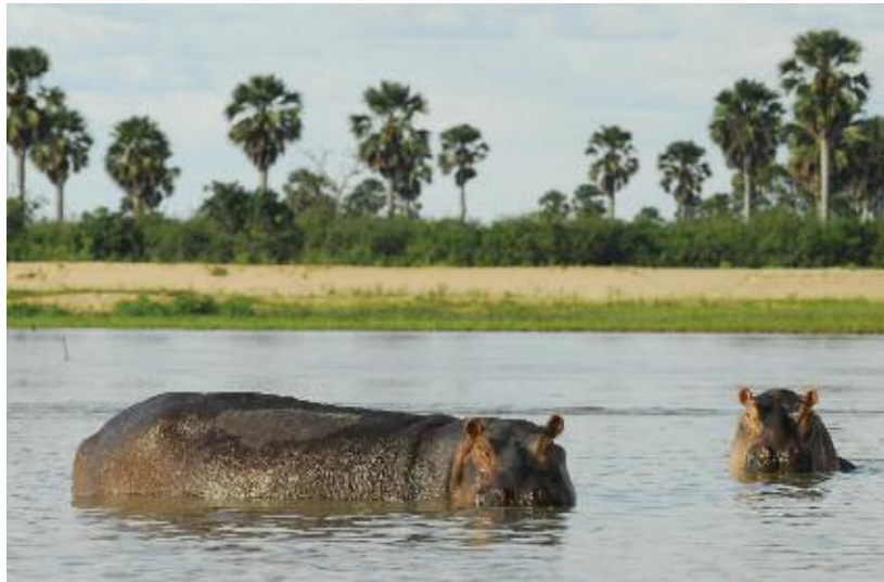
Sightings of hippos are common on the Rufiji River

Over 440 bird species have been recorded in the Selous. On the lakes you'll find pink-backed pelicans, African skimmers and giant kingfishers. The sandbanks are home to white-fronted bee-eater colonies, whilst ibises and palm thrushes nest in the borassus palms.