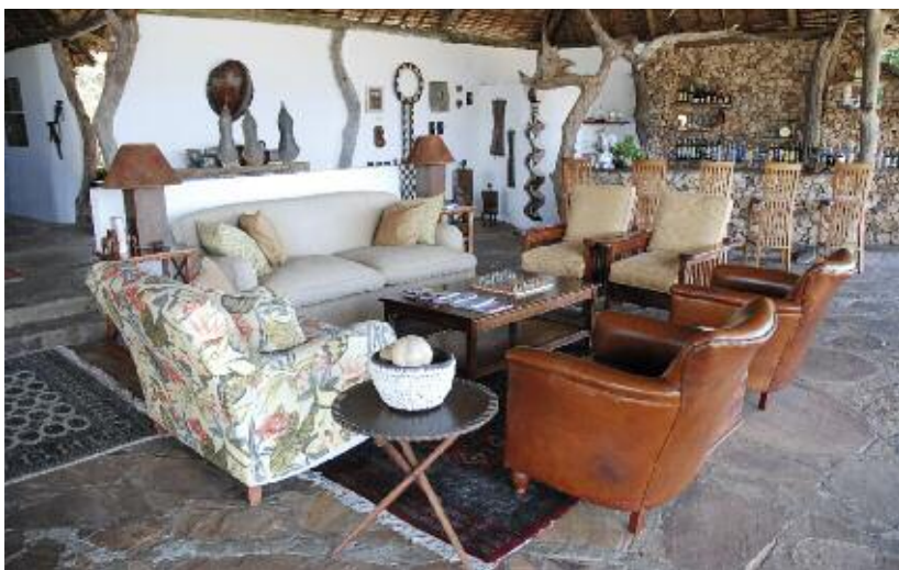
Open-sided lounge at Beho Beho: comfort in the bush

Relaxed lions lying in the shade of a tree