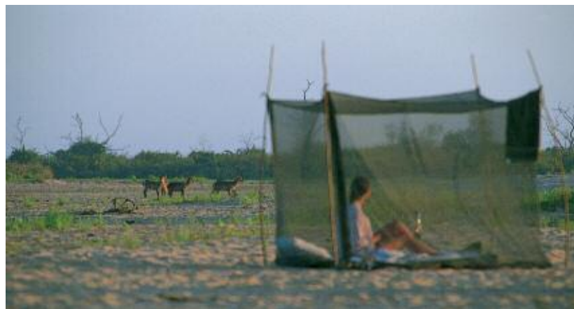
Nature up close: fly-camping in the Selous, from Sand Rivers

Later you'll retire to your comfortable bedroll under a cube of mosquito gauze; your armed guide will be sleeping close by. The (shared) toilets are long drop and the team also brings a dome tent, in case anyone feels nervous!