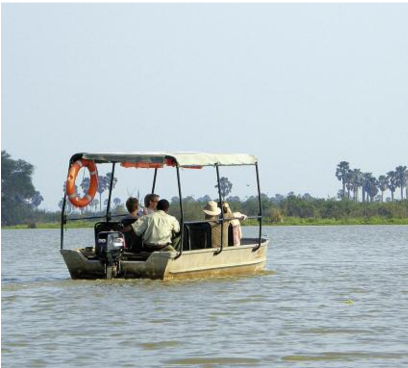
Exploring the Selous' lakes and rivers by boat

When we saw it, the camp was new, empty of visitors and was being run by competent old Tanzania hands – but for a relatively young camp it is very costly indeed.