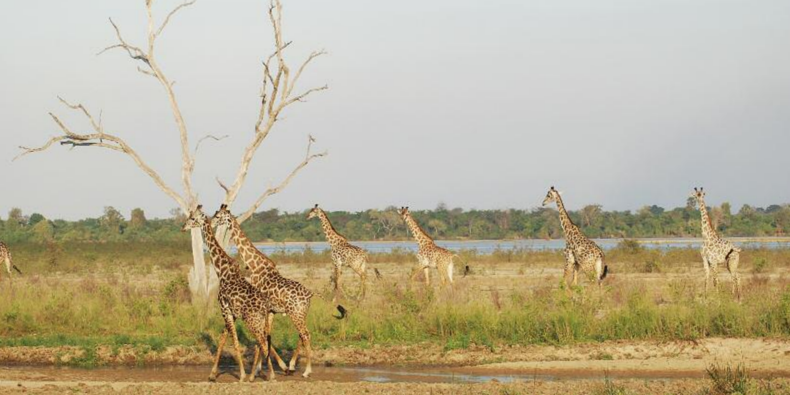
Giraffes live for 20–25 years on average