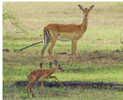
A newborn impala takes its first steps

Activities from both include guided walking safaris and 4WD safaris. There are also trips in small motorboats, which start from just in front of camp and explore the area's network of lakes and waterways around Lake Nzerekera and the Rufiji River.