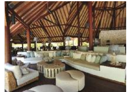
The natural and stylish lounge at Denis Island

and even in-room massages complete the package.