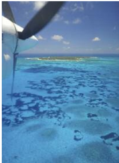
Flying into Denis Island; great views of the reefs

Along the northwestern coast of the island, 25 island-style cottages are set amid Denis's rich vegetation: three Beach Cottages; 10 Deluxe Beach Cottages; 10 Beachfront Spa Cottages; one Family Villa; and for those seeking extra space and pampering, the Beach Villa honeymoon villa. All are spacious, tastefully furnished and decorated in cool, calm colours, yet with an eye for Creole style and a spacious bathroom with private open courtyard. All lie within about 30m of their own stretch of beachfront, with its dedicated, shaded