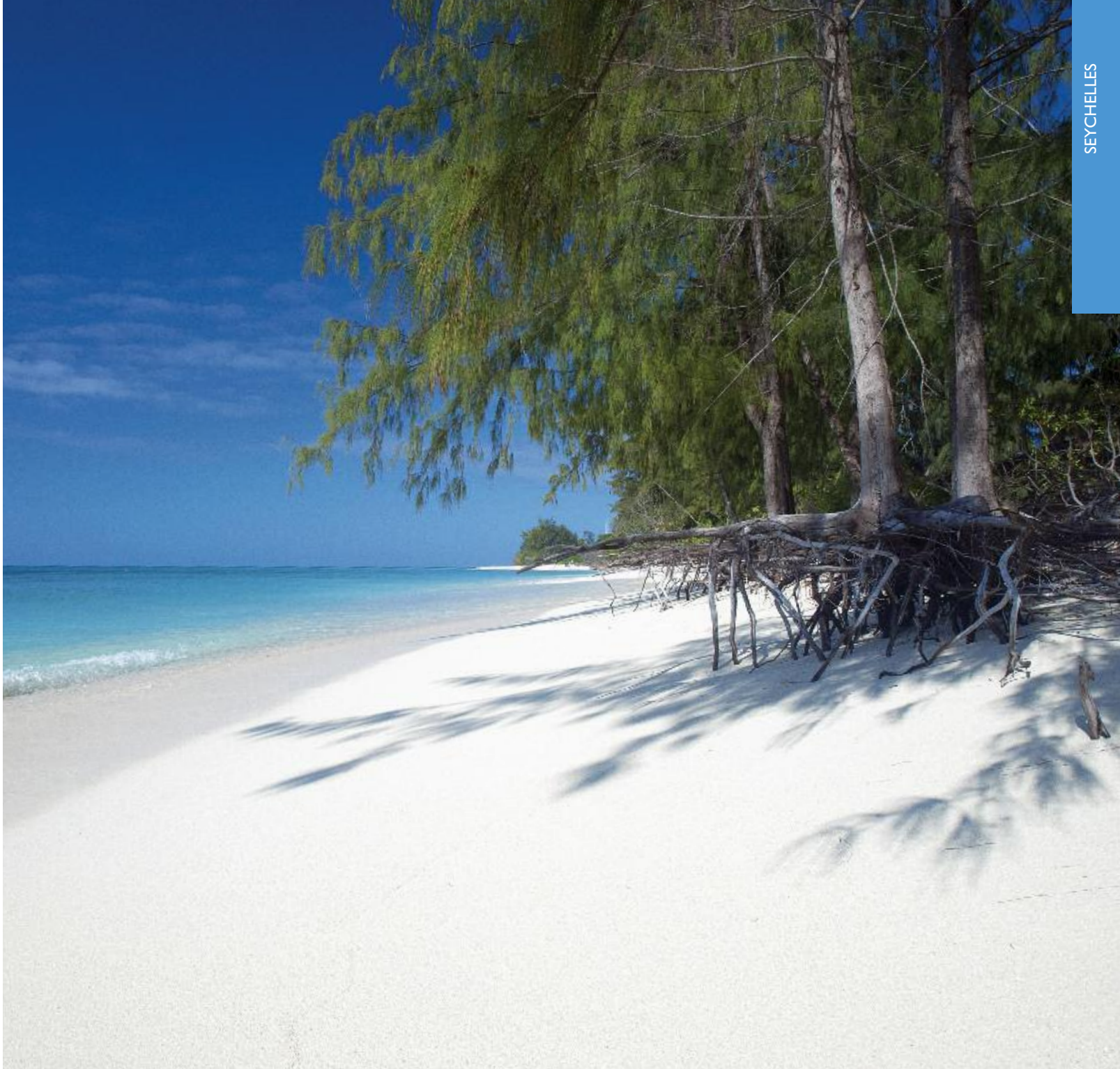
Many of the stunning, white beaches which fringe Denis Island are often deserted